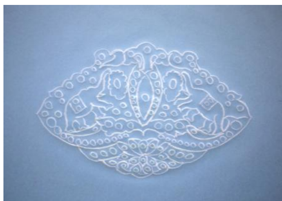
[Left: Image A7] "My Birth", 2015, Woodcut print, Drawing, Ink on board / reference image [Right: Image A8] "Richness", 2015, Nail drawing on tracing paper / reference image